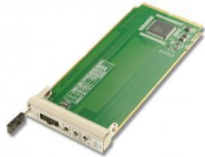
UTC008 MTCA JTAG Switch Module (JSM)