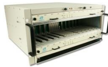
VT866 5U Chassis Platform