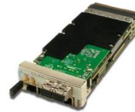
UTC004 MicroTCA Carrier Hub (MCH)