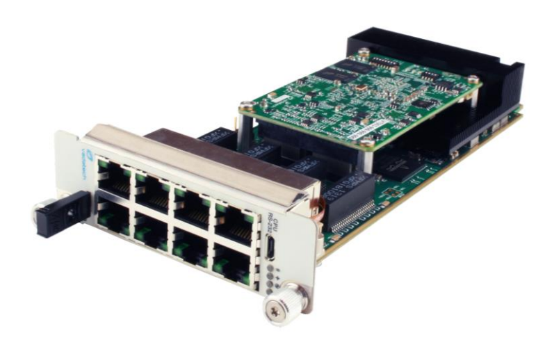
Figure 1: AMC249

The switch is managed via telnet and supports a rich set of features such as VLAN, RSTP, QoS, Mirroring, etc. The RS-232 interface in the front panel can also be used to manage the switch. The modules can support up to eight QoS queues per port with hierarchical minimum/maximum shaping per Class of Service (CoS), per queue, per port.