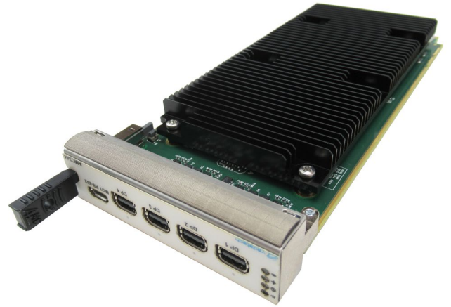
Figure 1: AMC344

The module offers 4 GB of GDDR5 memory and supports up to four independent displays with resolutions of 4096x2160 @ 60 Hz (4K Display). The module could also support one 5120x2880 @ 60 Hz single-cable or dual 5120x2880 @ 60 Hz dual-cable.