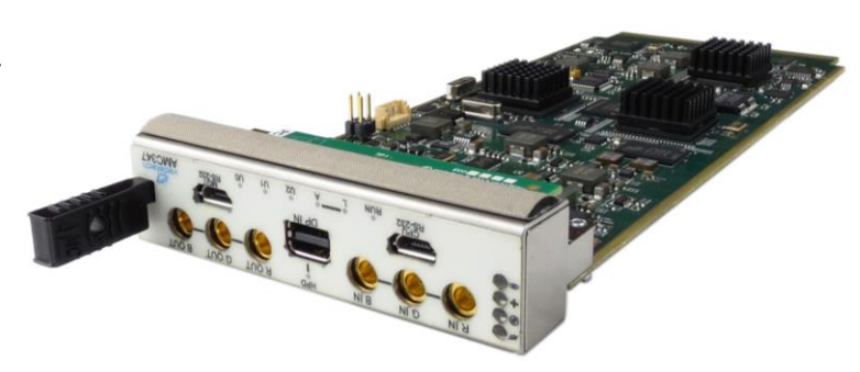
Figure 1: AMC347

See <u>Super Carrier</u> for high-density processing platforms compatible with this product.