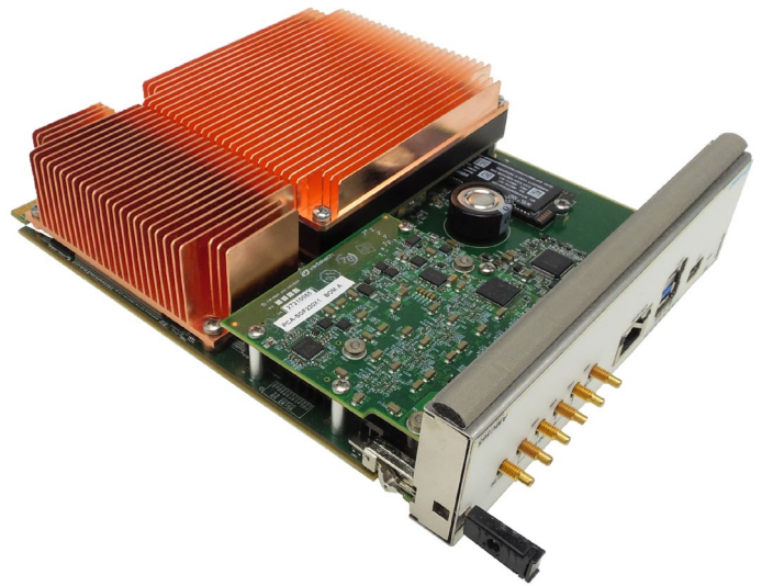
Figure 1: AMC585

The backplane dual GbE link (AMC.2) can be routed either to the FPGA or to the NVIDIA GbE via onboard MUX.