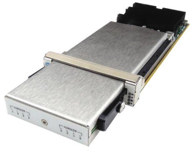
Figure 1: AMC633

The AMC633 is available in both air-cooled (MTCA.0 and MTCA.1) and rugged conduction-cooled (MTCA.2 or MTCA.3) versions.