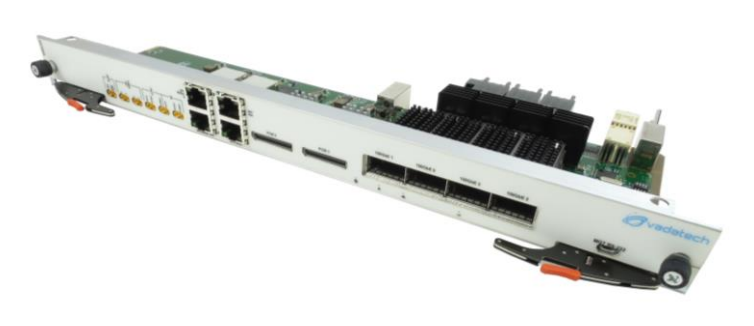
Figure 1: ART500A

ART500A also routes clock and trigger signals from Zone 3 to the rear panel and includes a built-in GPS receiver. The on-board GPS allows synchronizing to the GPS clock 1PPS and also provides the location, time data, etc. The bi-directional NMEA 0183 V3.0 protocol offers industry-standard data messages and command set for easy interface.