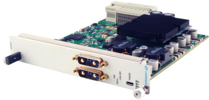
Figure 1: UTC013

The UTC013 is IPMI 2.0 and HPM.1 compliant with optional IPMI commands including warm/cold reset, re-arm sensor events, get device GUID, and get/set the hysteresis, threshold, and/or sensor event enable. The PMs follow the ATCA specification in fail-over for redundant IPMB-0 and FRU LED control. The units also have power channel control, get power channel status, PM reset, get PM status, and PM heartbeat. Temperature and current sensors are also included