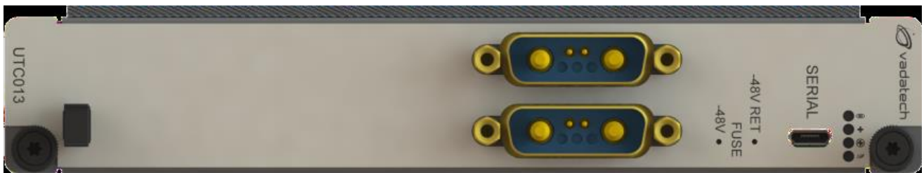
Figure 3: UTC013 Front Panel