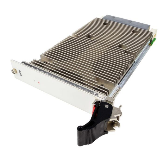
Figure 2: VPX100 with Rear I/O