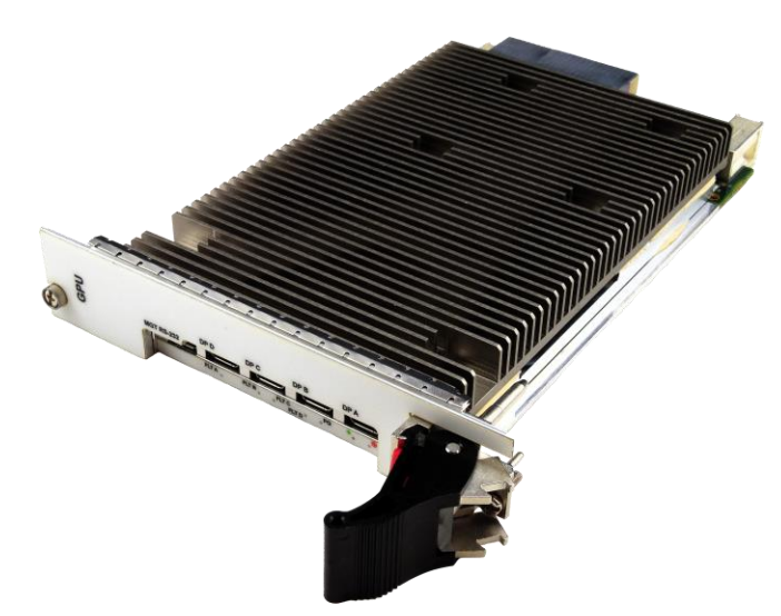
Figure 1: VPX100

The module supports Tier-1 and Tier-2 where the health management monitors the temperature of the module and reports to the higher-level shelf manager with a dedicated IPMI controller.