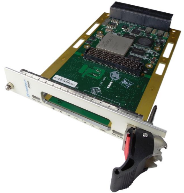
Figure 1: VPX517

Please contact VadaTech for details of Conduction Cooled versions.