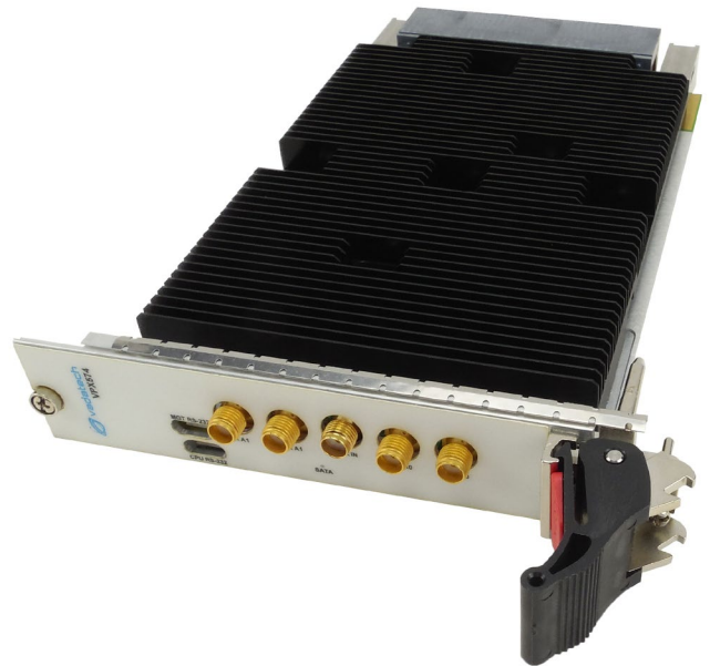
Figure 1: VPX574

The module has onboard 64 GB of Flash, 128 MB of Boot Flash and an SD Card as an option.