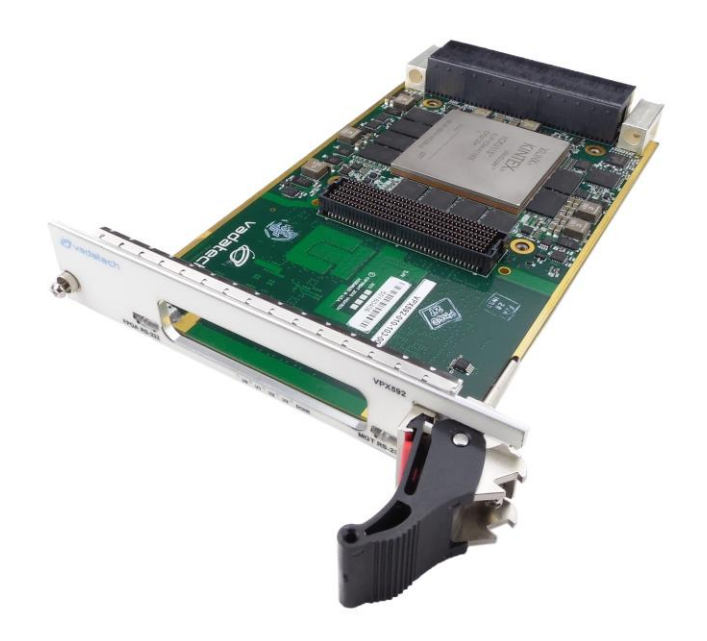
Figure 1: VPX592

Please contact VadaTech for details of Conduction Cooled versions.