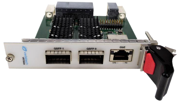
Figure 1: VRT584A

The module also has a 0.1" header for user defined I/O which is configurable by the FPGA as seven LVDS or 14 Single Ended.