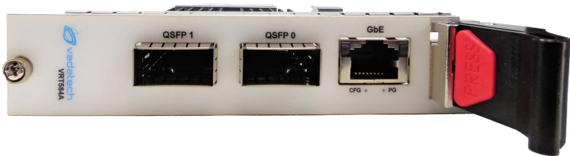
Figure 3: VRT584A Front Panel View