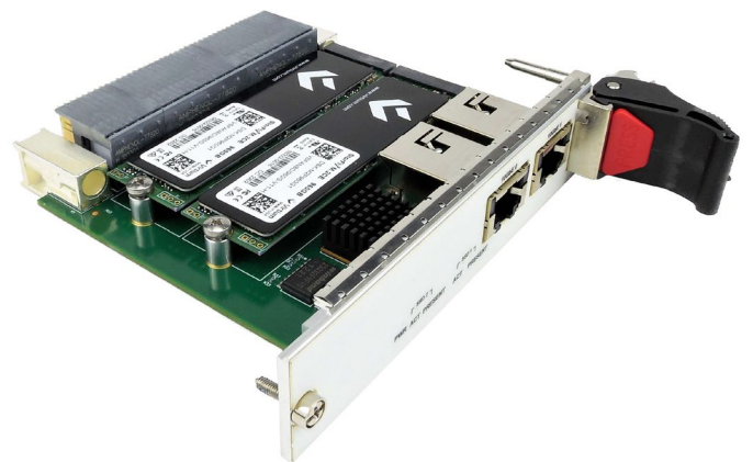
Figure 1: VRT761A

VRT761A has dual M.2 SATA Socket as well as Dual 10GbE Copper ports.