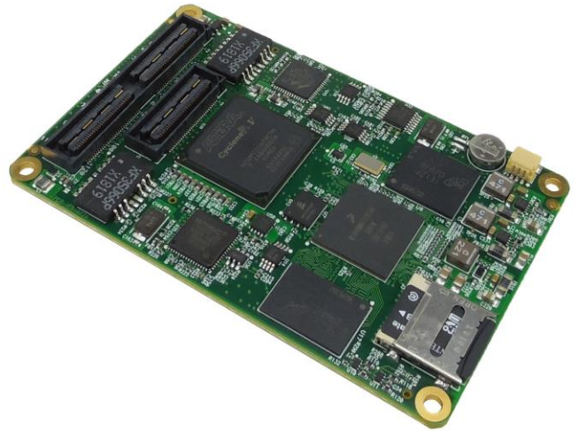
Figure 1: VT040

VadaTech's Scorpionware™ software can be used to access information about the current state of the Shelf or the Carrier, obtain information such as the FRU population, or monitor alarms, power management, current sensor values, and the overall health of the Shelf. The software GUI is very powerful, providing a Virtual Carrier and FRU construct for a simple, effective interface.