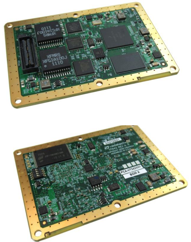
Figure 1: VT042

VadaTech's Scorpionware™ software can be used to access information about the current state of the Shelf or the Carrier, obtain information such as the FRU (Field Replaceable Unit) population, alarms monitoring, power management, on-board sensors' value, and the overall health of the Shelf. The software GUI is very powerful, providing a Virtual Carrier and FRU construct for a simple, effective interface.