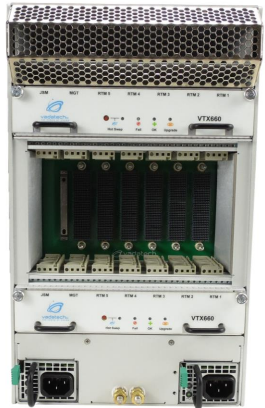
Figure 5: VTX660 Chassis Layout - Rear