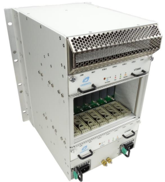
Figure 2: VTX660 Rear View