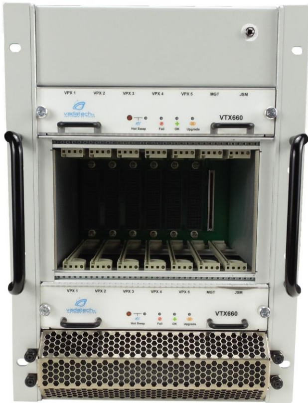
Figure 4: VTX660 Chassis Layout - Front