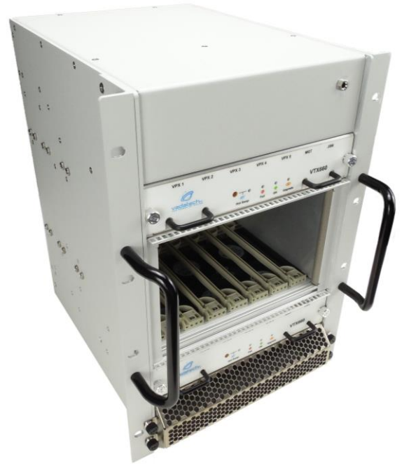
Figure 1: VTX660 Front View

There is an optional JSM to provide JTAG access to the front.