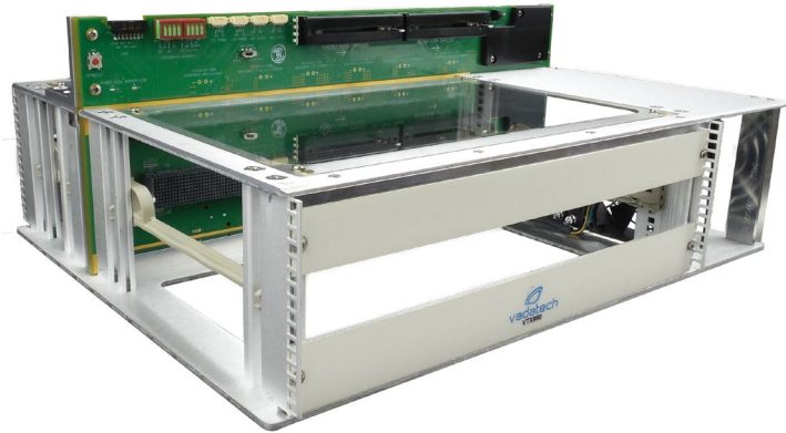
Figure 1: VTX990 Chassis Front View

The backplane breaks-out the JTAG signals via a header connector to enable external connection of a JTAG probe.