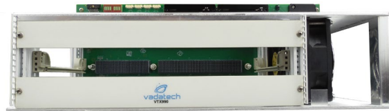
Figure 5: Chassis Layout – Front Vertical