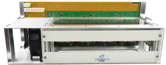
Figure 4: Chassis Layout - Rear