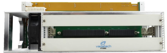
Figure 6: Chassis Layout – Rear Vertical